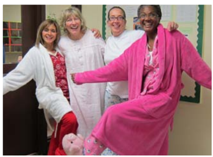
BHMS Community hosts PJ day in support of the BHMS Terry Fox Event.