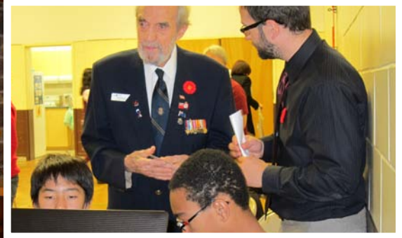
Above: Junior High students coordinate Remembrance Day Ceremony to include veterans visit.