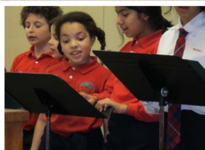
Worship Team performs to raise donations for St Mary's Home.