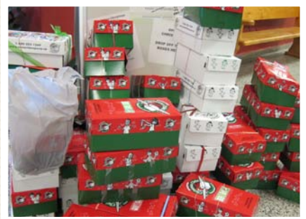
Thank you to all families who supported Operation Christmas Child.