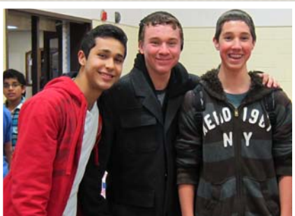
Alumni visit Junior High Marketplace 2012.